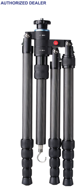
Flat design makes it easy to carry and store in backpacks and carry-ons.

S-N series flat style tripods have an extremely functional appearance, are only 1.6 inches (4 cm) thick when folded flat and are small enough to be easily carried and stored in a suitcase or backpack. All S-N series tripods have 8 layer carbon fiber legs for maximum load handling and light weight.